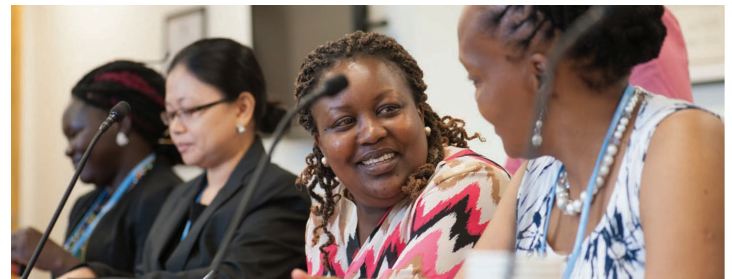
Advocates consistently say the peer-to-peer learning that occurs is one of the highlights of their HRAP experience.

The Advocates traveled to WITNESS in Brooklyn, where they participated in a workshop on the effective use of video advocacy as a complement to traditional approaches to human rights advocacy. Advocates learned the ways in which stories, visual evidence and personal testimony can be used as part of a human rights advocacy strategy to inform policy.